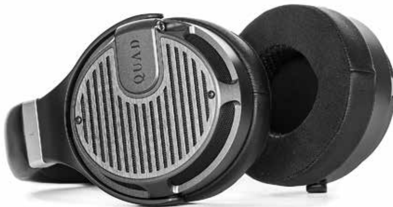
ABOVE: Over-ear design with a reasonable amount of adjustability ensures a good fit, although this is not the sort of headphone to entirely seal out all external noises

Consistently vivid, regardless of headphone amp, the ERA-1 had the requisite amount of splash and effervescence for this instrument. It was more than enough of an indication of sonic authenticity to tell me that this headphone is clean and transparent, varying in behaviour according to source – as it should be.