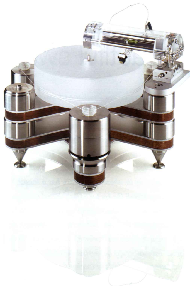
All clearaudio turntables are mechanical and design masterpieces